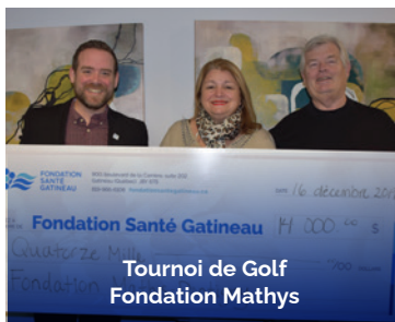
Tournoi de Golf Fondation Mathys