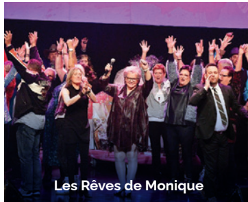
Les Rêves de Monique