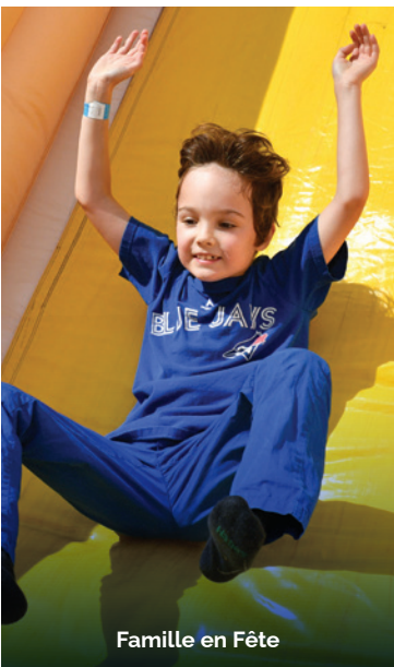
Famille en Fête