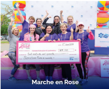
Marche en Rose

The Gatineau Health Foundation's team would like to acknowledge the work and commitment of the organizers, volunteers, sponsors and participants who make our fundraising activities possible year after year. Our many successful events have shown beyond any doubt the community's support for our cause. Thank you all for your dedication and for your vibrant engagement alongside us in service of a great cause: healthcare in the Outaouais region!