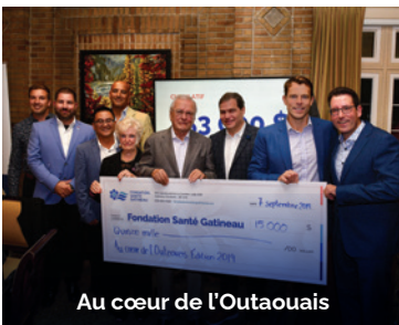
Au cœur de l'Outaouais