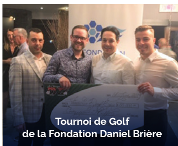
Tournoi de Golf de la Fondation Daniel Brière