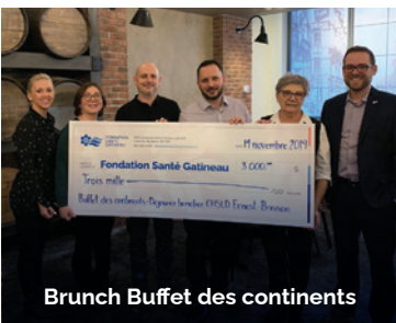
Brunch Buffet des continents